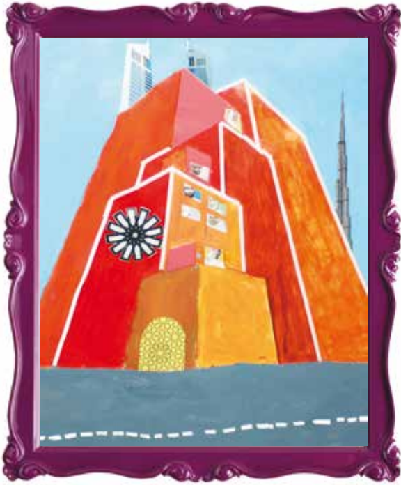
Mohammed Zain Fiazuddin