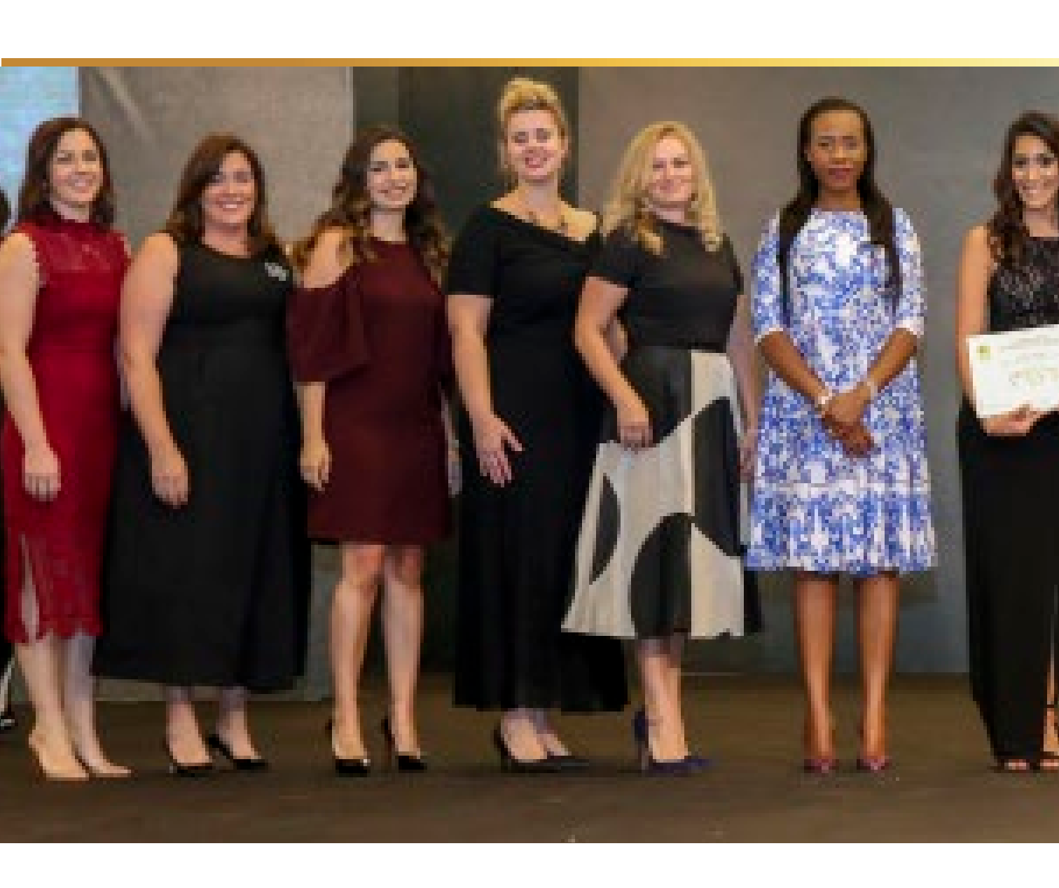
Early Years EIS-Jumeirah