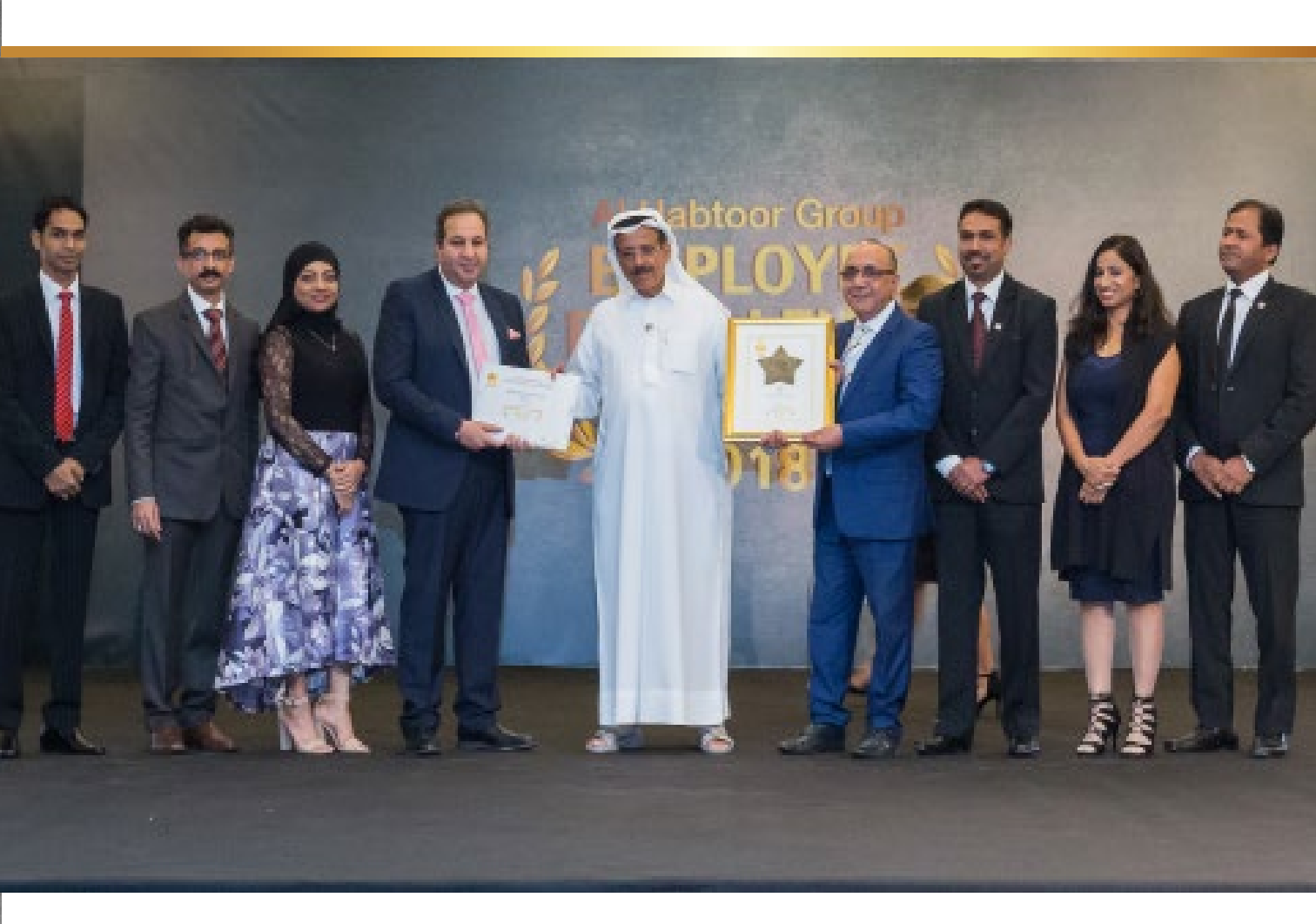
Metropolitan Hotel Dubai HH