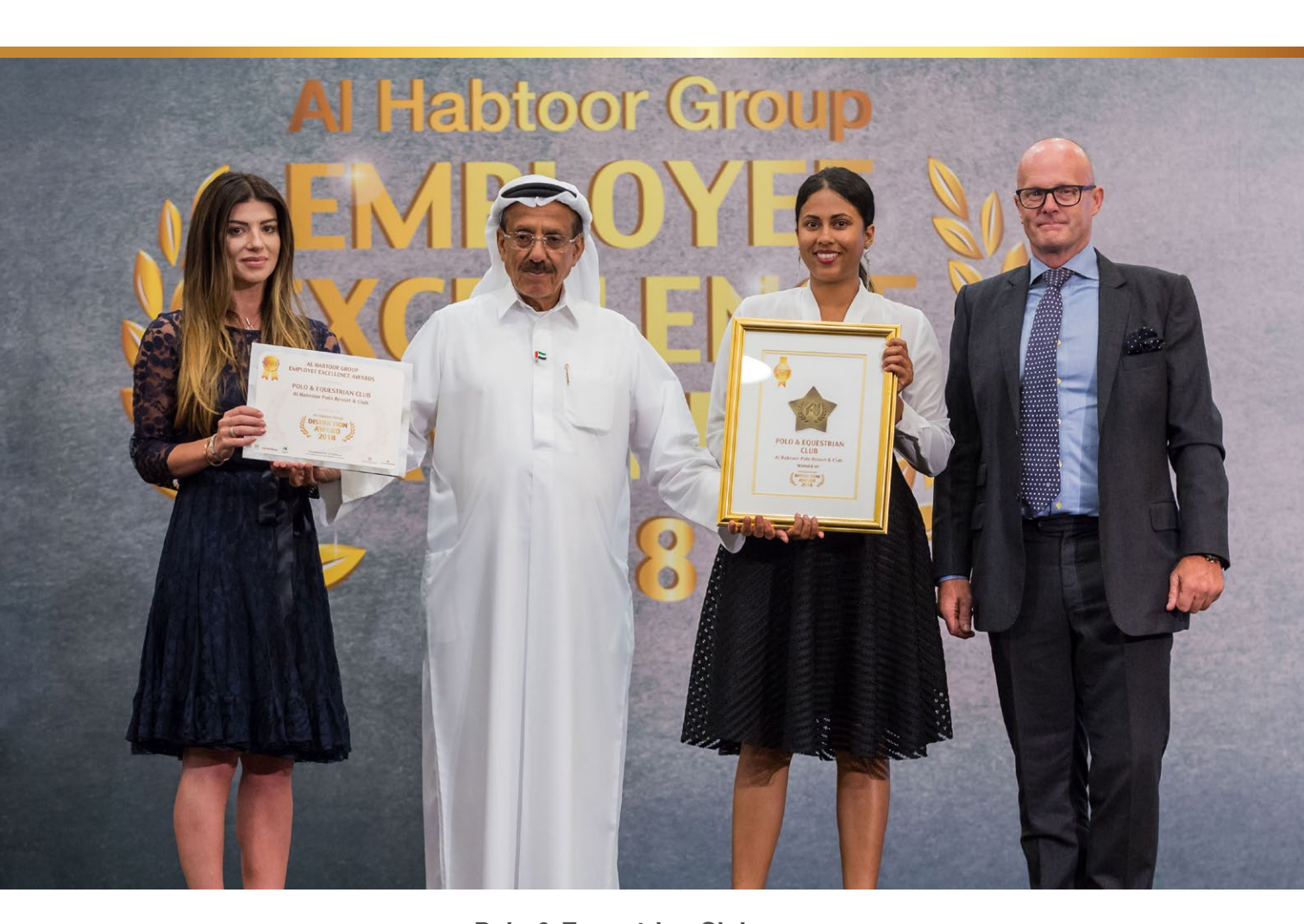
Polo & Equestrian Club Al Habtoor Polo Resort & Club HH