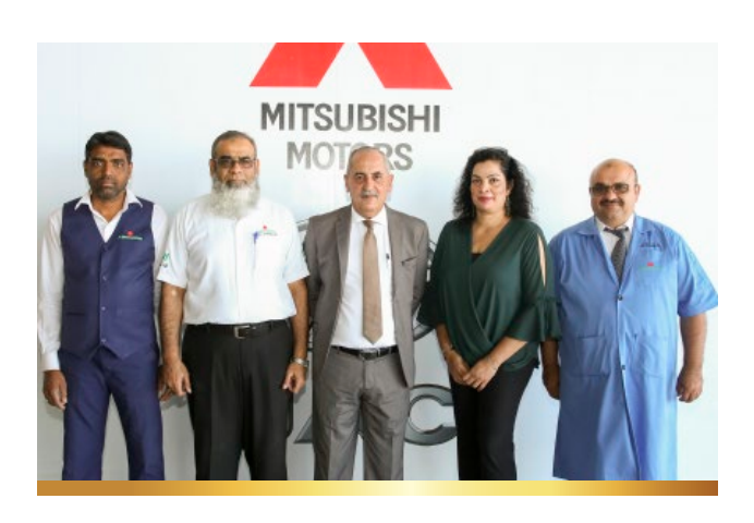
DIC Technical Division AHM