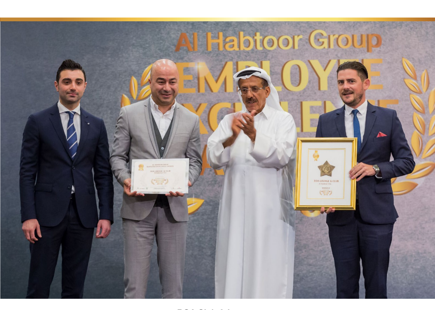
BOA Club & Lounge Al Habtoor City HH