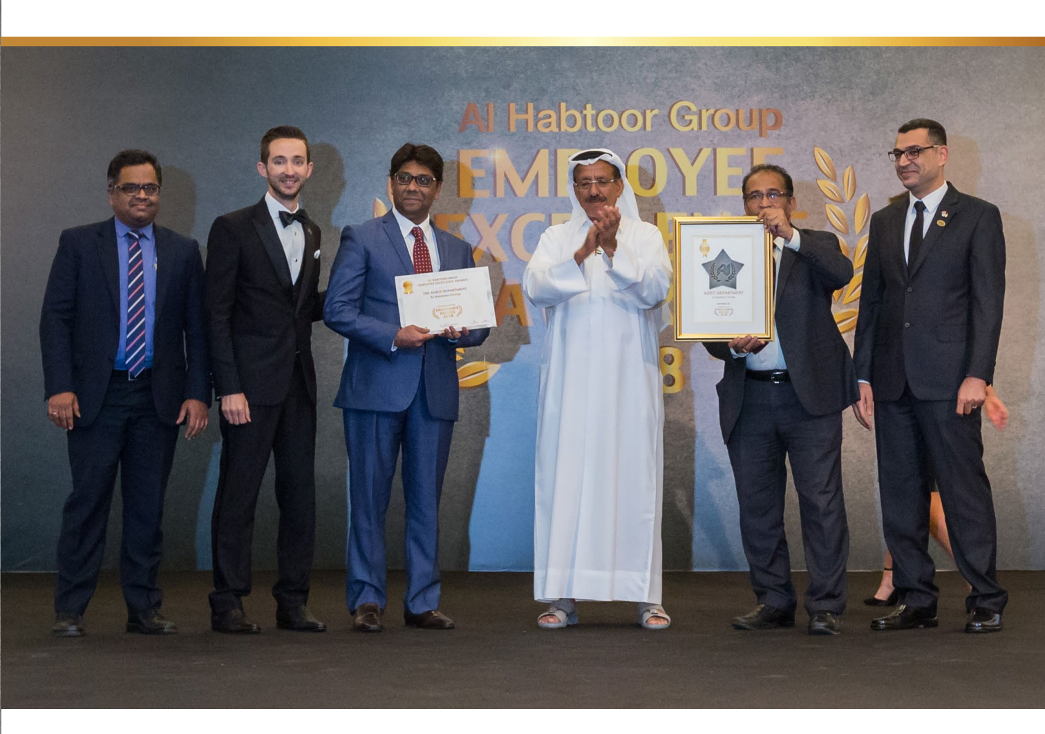
Audit Department AHG