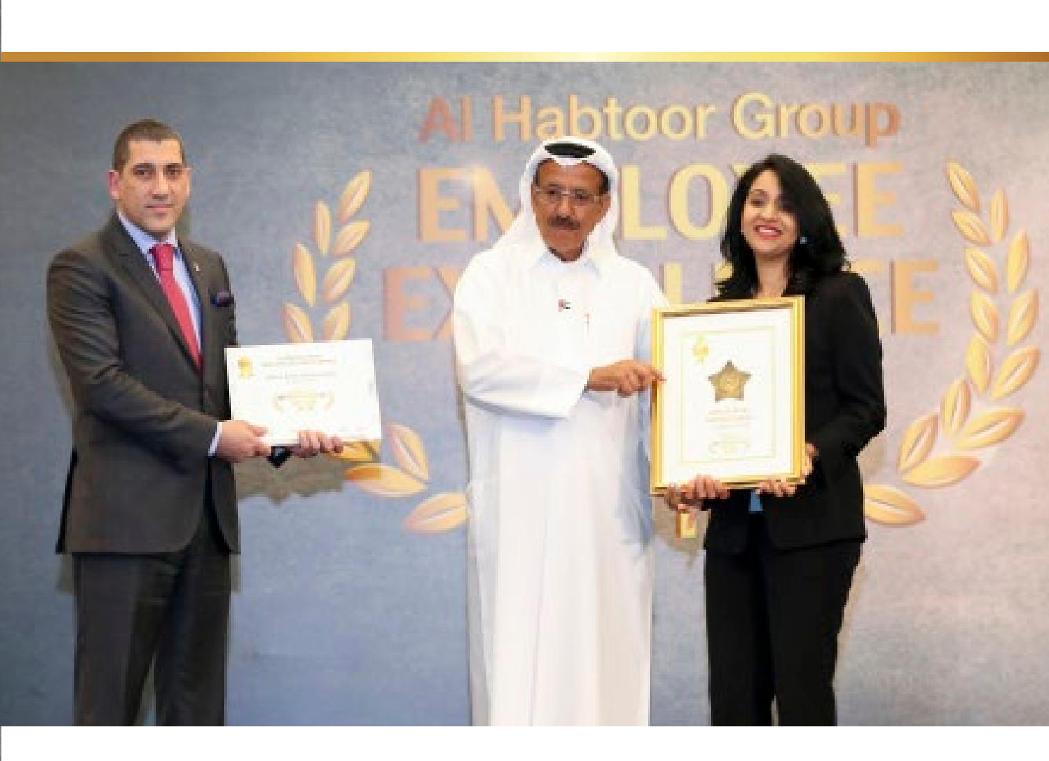
Group Risk Managment AHG