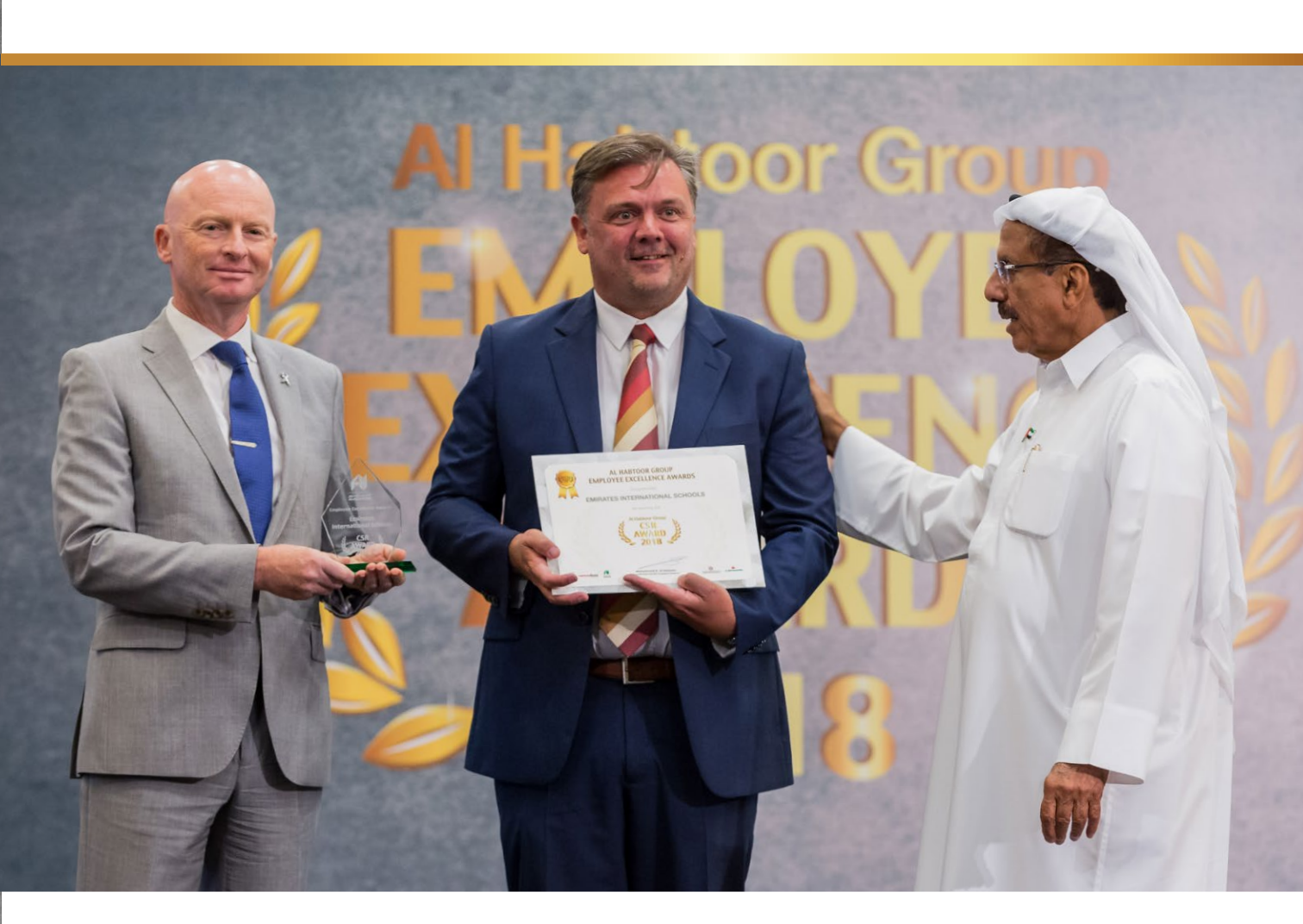
Emirates International Schools