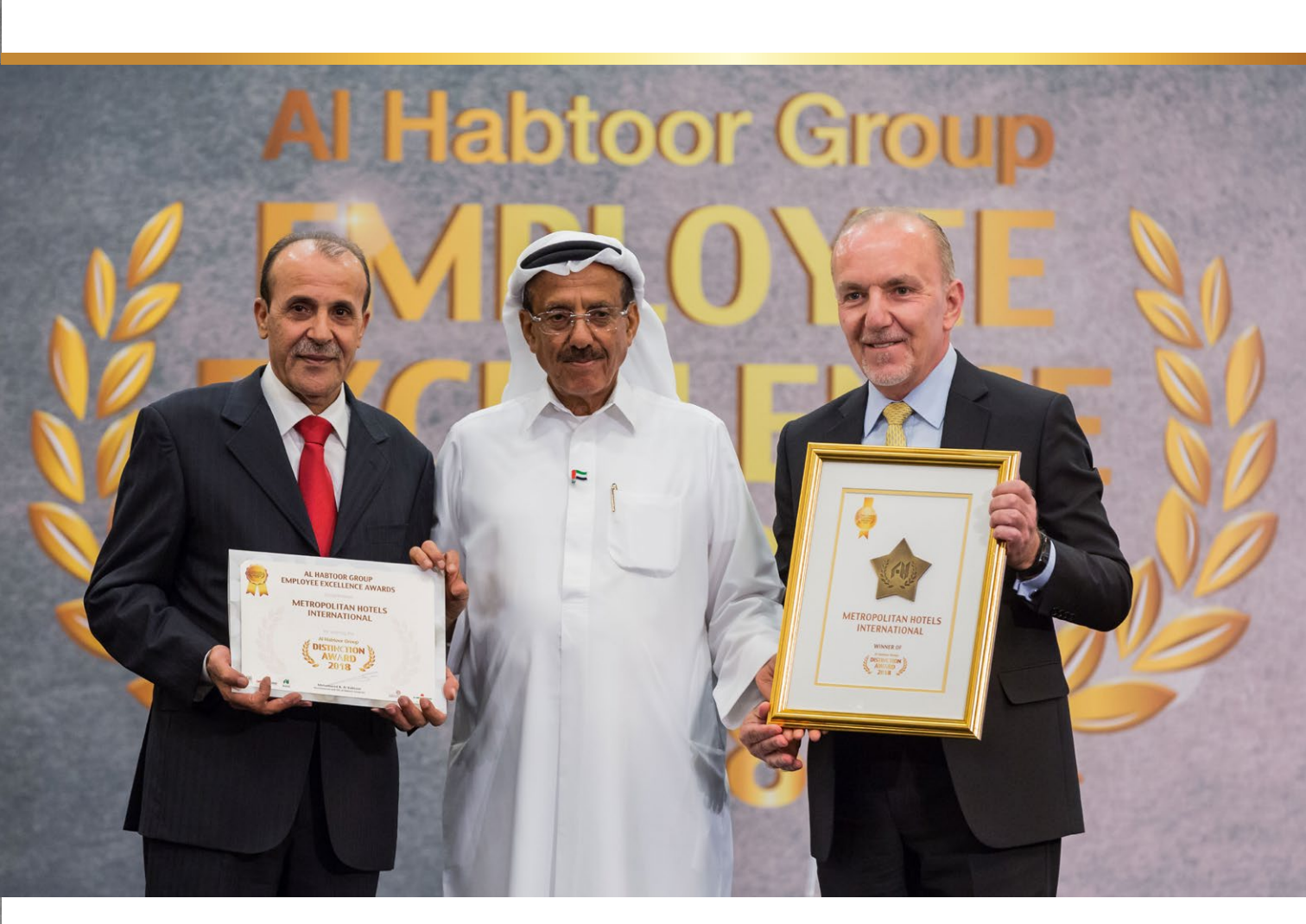
Metropolitan Hotels International HH